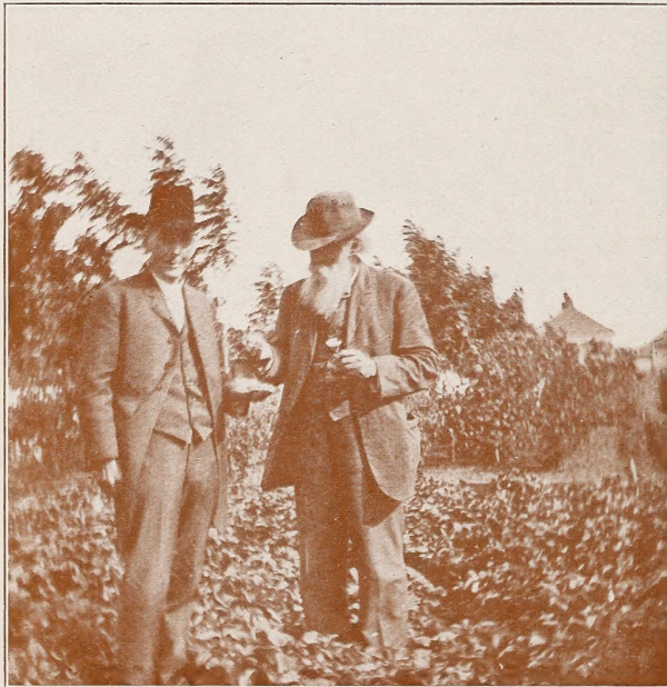
The Poet John Burroughs Likes Patagonia Strawberries.—See Page 15.

Nearly ninety-five per cent. of the new plums introduced since 1890, now catalogued as standards, originated on my own farms, although nearly four times as many new varieties have been introduced by other dealers. Most of the introductions of others are not now generally even listed. Then if you should again happen to ask